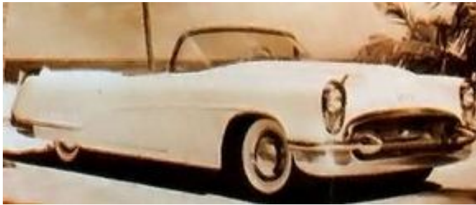
Left, the 1953 Buick Wildcat was the first show car to bear the Wildcat name.

Then in 1962, Buick brought out the first production Wildcat, a new factory hot rod designed to compete with the Oldsmobile Starfire and Pontiac Grand Prix. But 1970 saw the last year for the Wildcat.